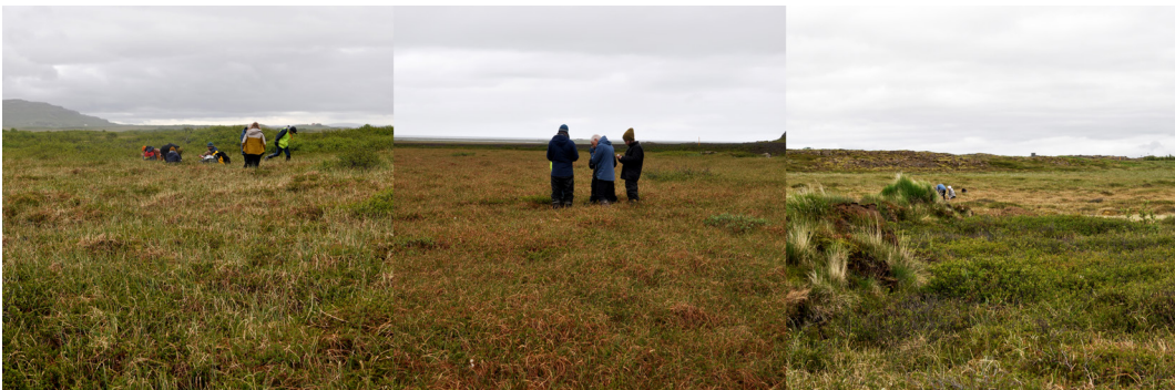
Fig. 2. Study sites 1, 2 and 3, respectively from left to right.

In addition to the three study sites, we visited two sites with hot springs (Fig. 3), where we did not measure coverage sample plots, but gathered Sphagnum samples to be identified with a microscope. The first hot spring site was in Kleppjárnsreykjum (64°39'12.557"N; 21°24'36.148"W). The site has been harnessed for geothermal heating purposes of nearby housing. Common vascular plants on the sides of the spring included Hydrocotyle vulgaris and Equisetum fluviatile . Ground temperature at 0.5 meters distance on the side of the spring was measured at +42 °C.