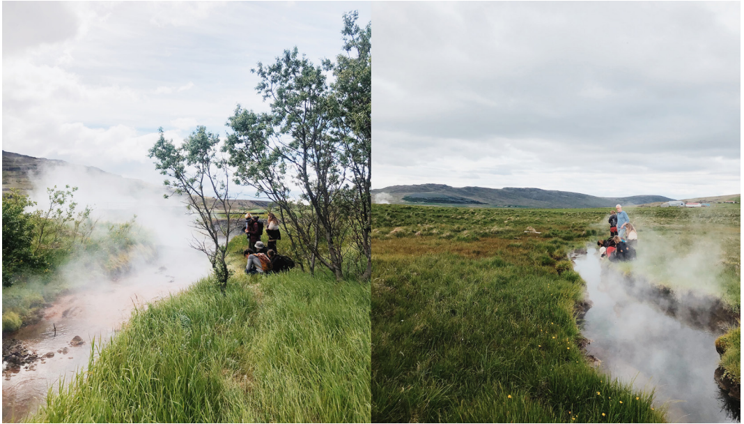
Fig. 3. Hot spring sites K (Kleppjárnreykjum) and H (Hurðarbak), respectively from left to right.

Kuva 3. Kuumat lähteet K (Kleppjárnreykjum) ja H (Hurðarbak) vasemmalta oikealle.