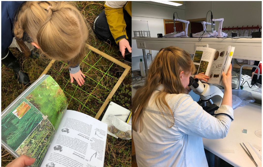
Fig. 4 a) Identifying vascular plants at a sampling plot. 13.6.2022. b) Identifying Sphagnum species in the laboratory. 14.6.2022.

Kuva 3. Kuumat lähteet K (Kleppjárnreykjum) ja H (Hurðarbak) vasemmalta oikealle.