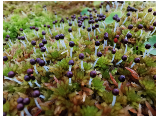
Fig. 5. Plentiful of sporophytes of Sphagnum subnitens appeared along the hot springs in Hurðarbak.

Kuva 5. Kirjorahkasammalen ( Sphagnum subnitens ) itiöpesäkkeet olivat hyvin runsaslukuisia Hurðarbakin kuumilla lähteillä.